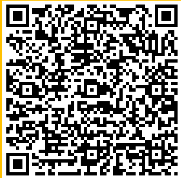
QR Folder SAFE app