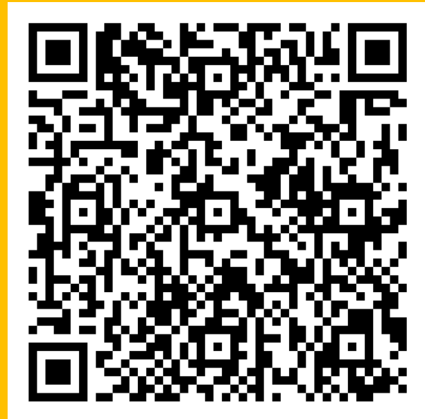
Video: A personal story